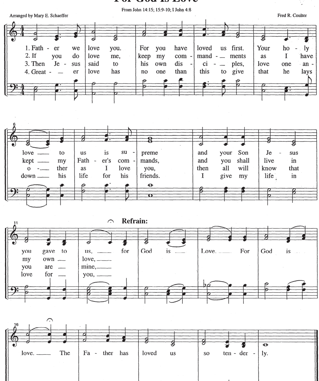
© 1997 by Christian Biblical Church of God